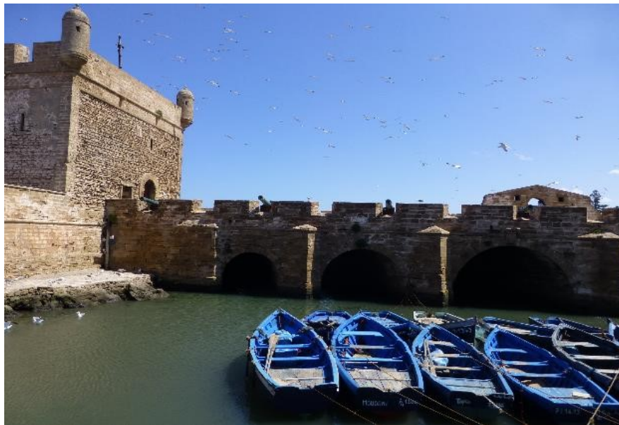
Figure 2: Photo De La Skala Du Port d'Essaouira Reconstitue Sur L'ancien Fort Portugais Le Castelo Del Real.

In our methodology, we were inspired by Clifford Geertz's seminal notion from 1973 that 'Man is an animal suspended in webs of significance he himself has spun,' while also incorporating insights from the fields of semiotics (Pierce, 1935-1994) and semantics (Morris, 1971) Our initial point of departure was a comprehensive examination of the city's image through the interconnected frameworks of iconography, semiology, and semantics. Subsequently, we delved into an interpretative analysis of the myriad channels of messages and discourses that these frameworks produce, serving not only as carriers of fluctuating meanings but also as components of identifiable communication systems.