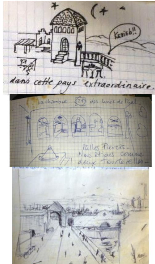
Figure 6: T Book of a Guest House

In summary, the analysis of this corpus has allowed us to suggest that the image of the city is defined in reference to two dimensions: visible and sensible. Both are dependent on the circumstances in which they are defined (formed), in addition to their primary vectors: the person who produces them and the person who receives them.