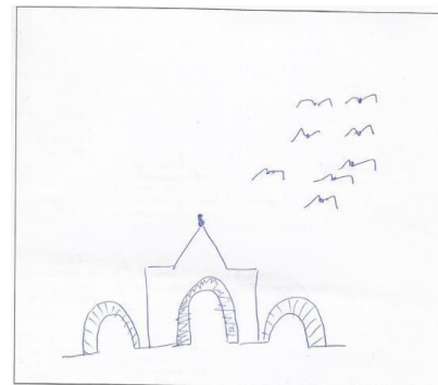
Figure 5: The Mental Maps Depicted by the Respondents Who Have a Strong Emotional Attachment and Have Been Residing in the City for Several Decades Were the only ones to Represent the Seagulls Marking the City's Soundscape.