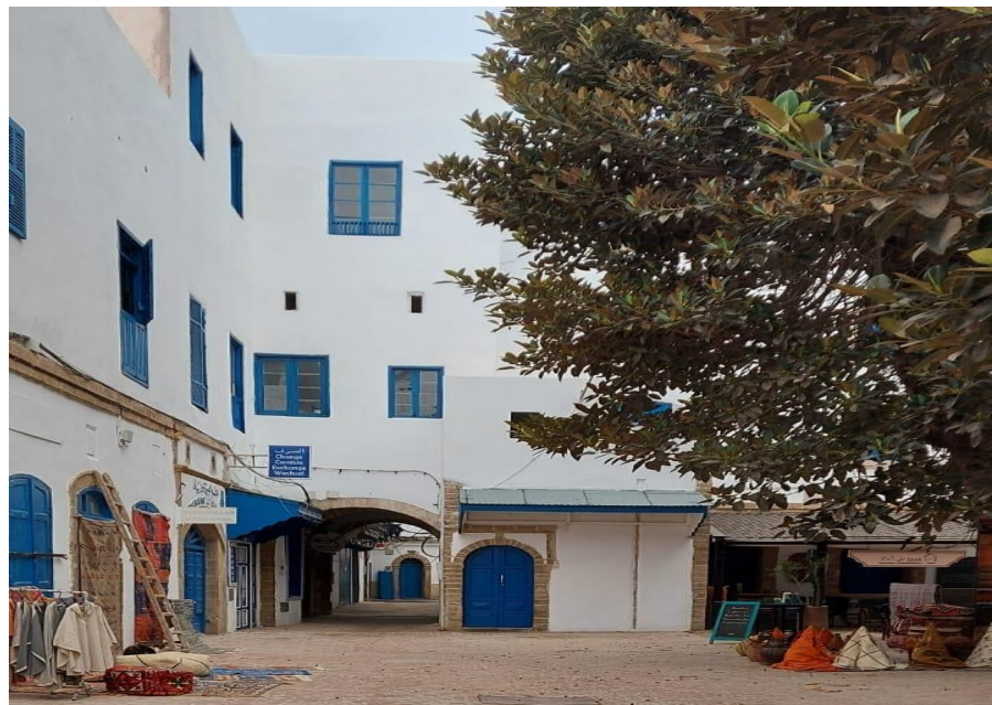
Figure 1: Place De L'horloge Essaouira À L'entrée De La Kasbah.

To facilitate this, we collated a comprehensive corpus of data, drawn from a plethora of sources that reflect both the overt and covert dimensions of the urban environment. Our aim was to approach the city in all its complexities, embracing its nuances, paradoxes, and temporal rhythms, while being attuned to its historical lineage, its demographic fabric, and its defining events.