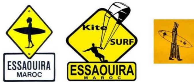
Figure 4: Stickers for Sale in Essaouira.